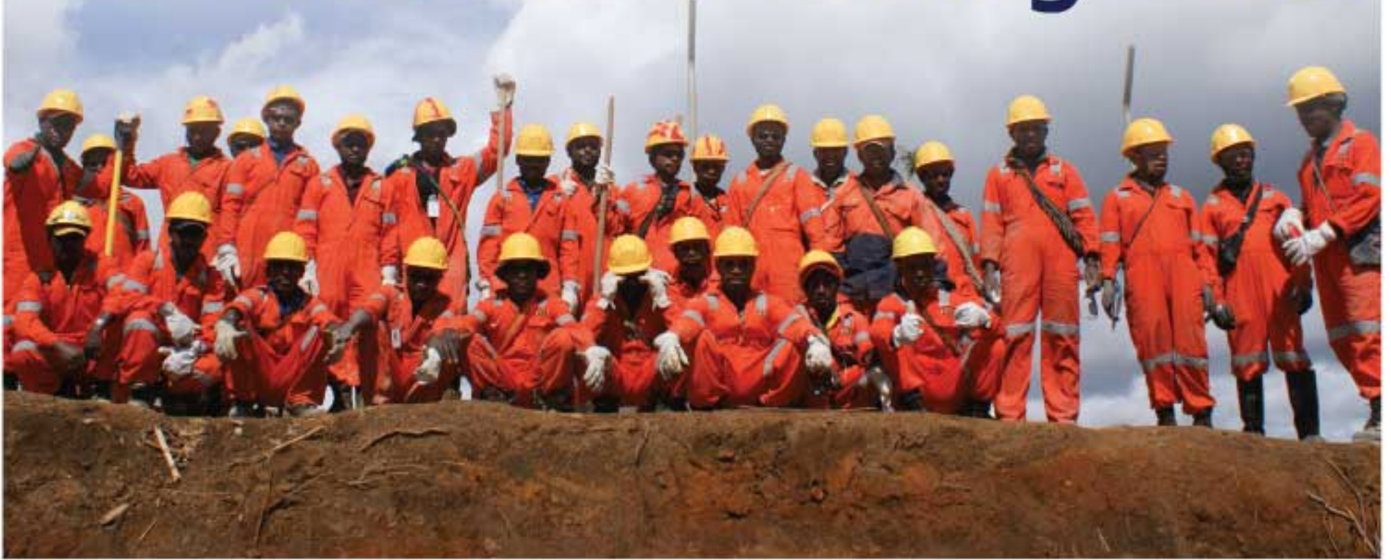
Hides Gas Development Company workers.

Umbrella Representative Landowner Company for PNG LNG operations within Southern Highlands and Hela Provinces, Hides Gas Development Company (HGDC) played a significant role in the construction of PNG LNG.