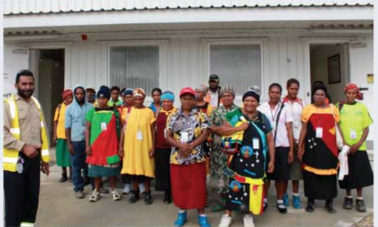
Members of Nogoli community visit HGCP.

They also stopped over at the ISOS medical centre where the medical staff had the opportunity to do a brief