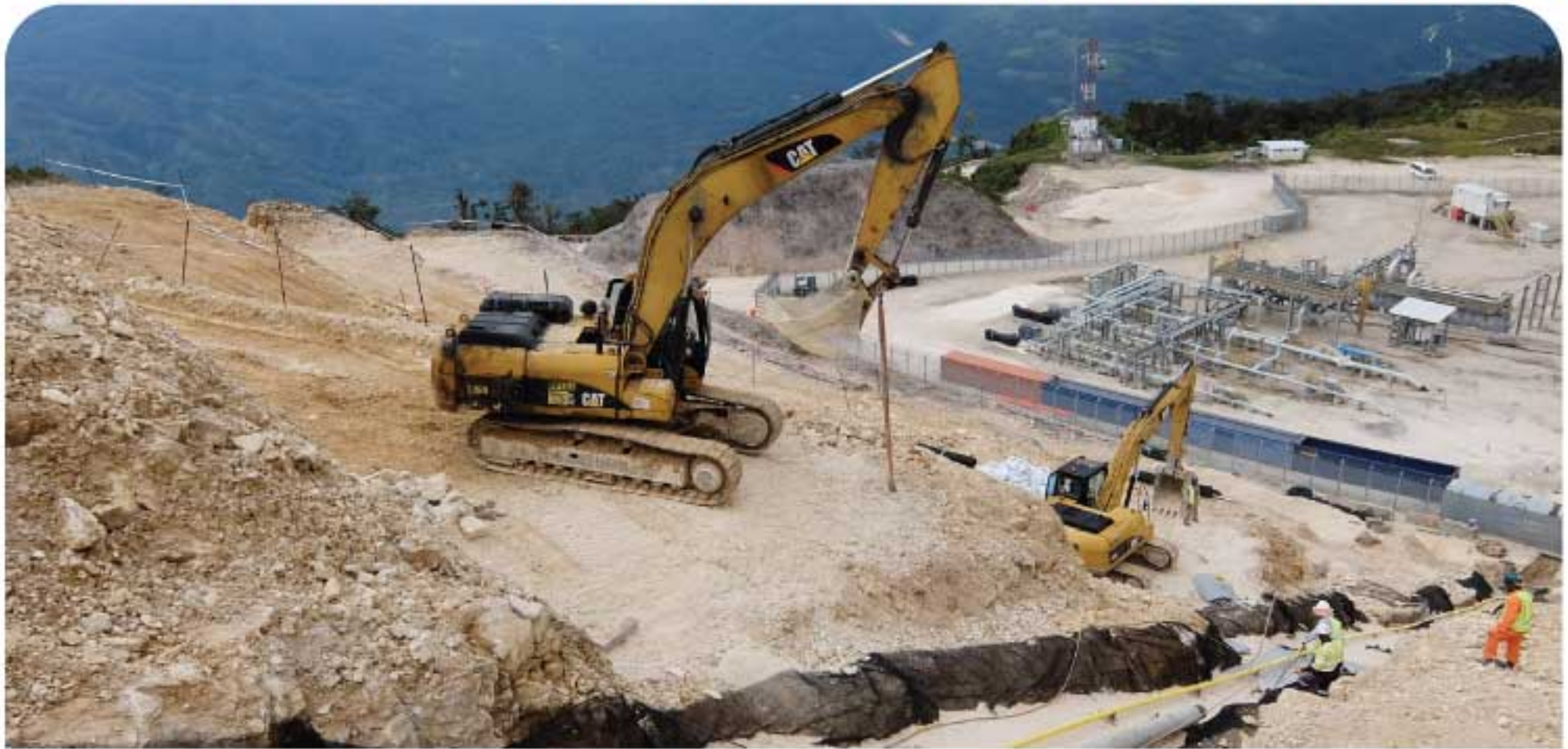
Connecting Well Pad F to the spine line.

2 ExxonMobil PNG (EMPNG) and PNG LNG co-venturers are continuing to invest in infrastructure with two new projects advanced in 2016. A new wellpad 'F' has been built and connected to the spine line feeding into the Hides Gas Conditioning Plant. Wellpad F is also the highest for PNG LNG at an elevation of 2800 metres. Production from the wellpad is expected to commence early in 2017 once mechanical and pressure testing have been completed. This year EMPNG also advanced preparatory work to tie the Angore field into the