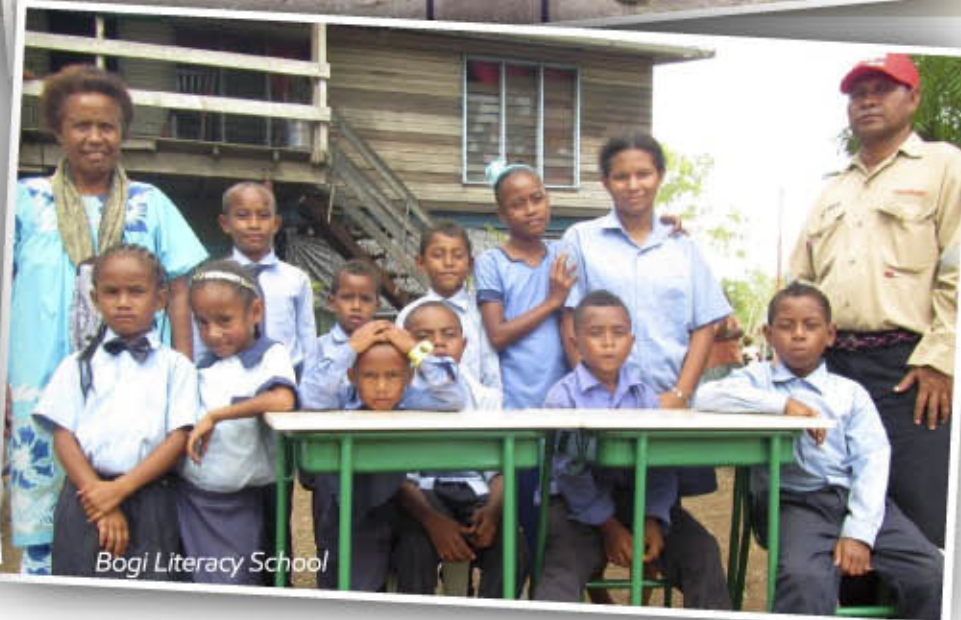
Bogi Literacy School