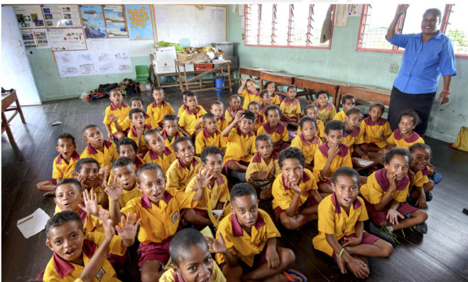
A happy class of elementary children and their teacher are all smiles at Papa Elementary School.

"We started from scratch. The P&C discussed the land issues with clan leaders and resolved the issue."