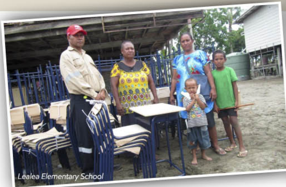
Lealea Elementary School