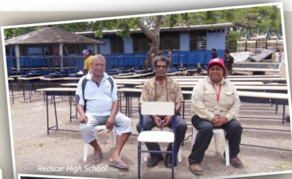
Redscar High School

Recently, our Community Affairs team were delighted to donate desks, tables and chairs to schools in the LNG plant site village communities. Desk sets were delivered to Bogi Literacy School, Redscar High School, Porebada Elementary School, Edith Preschool, Maiari Preschool, Porebada SDA Preschool, Boera Elementary School, Papa Elementary School, Lealea Elementary School and Porebada Primary School.