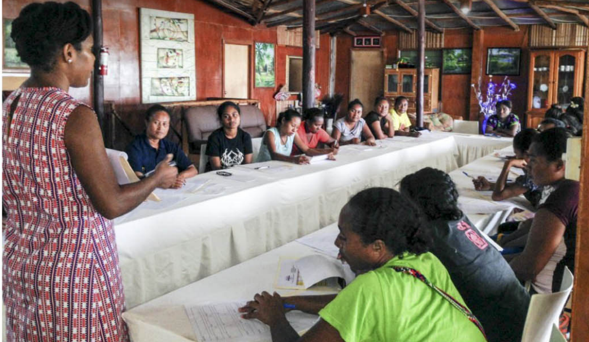
Young women from Porebada village participated at the Rise Up training conducted by YWCA.

As an organisation committed to promoting the leadership of young women, with support from PNG LNG, the Young Women's Christian Association of PNG (YWCA), conducted a week long training program in Boera for young women in the LNG Plant communities. The Rise Up training is a crucial program that educates and