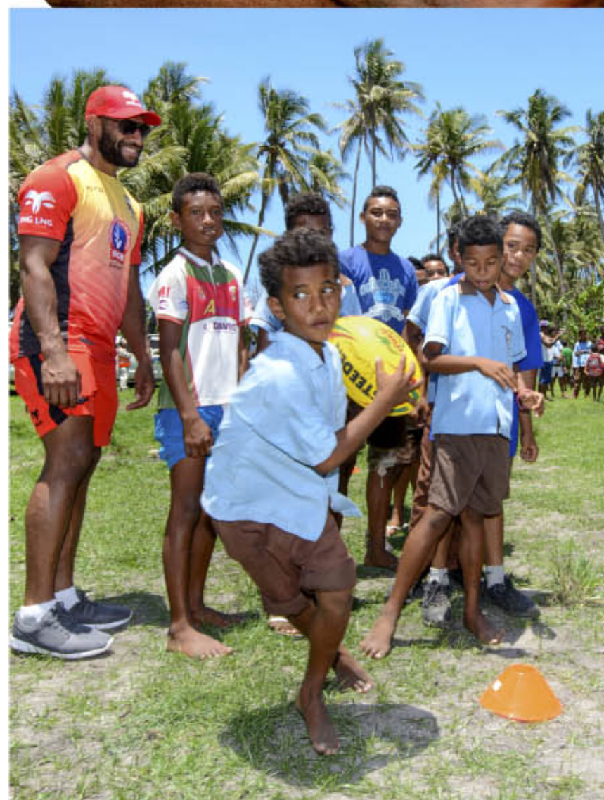
PNG LNG Kumuls players ran a coaching clinic at Boera village.