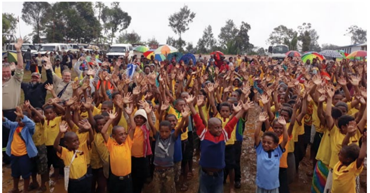
Para Primary School students celebrated the re-opening of the school earlier this year.

"Generally, the kids are interested to come to school. Education helps to provide them with a foundation and a structure. Having teachers on the ground is important to their development and growth into young adults."