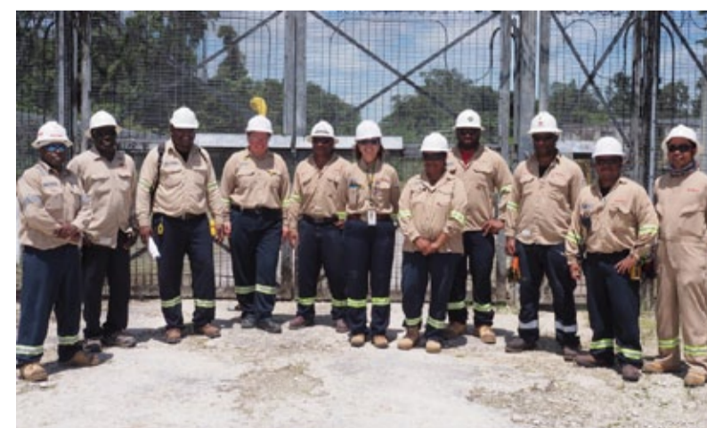
(Top): Upstream maintenance team ready for the PIGGING exercise which took 3 days to complete.