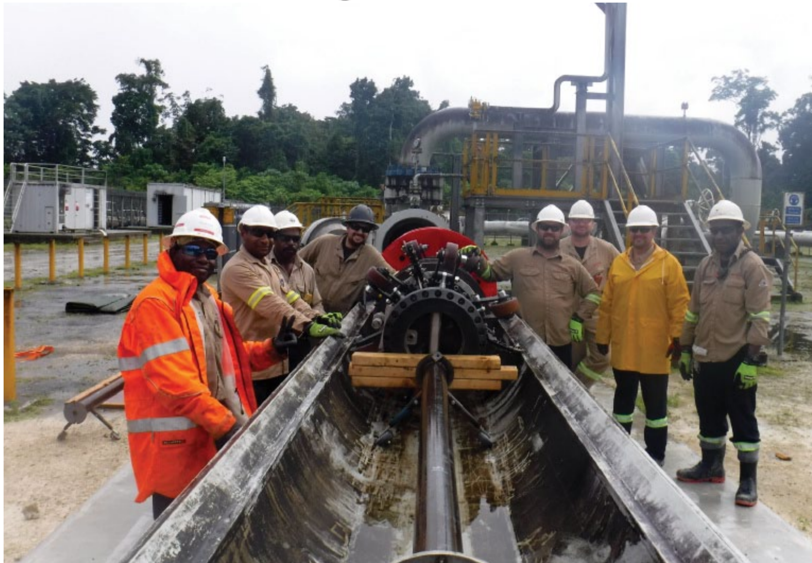
Maintenance crew launching the PIG at the Kopi Scrapper Station in Hela Province.

“We had a much better interaction amongst the team and because we had a very strict schedule, we made sure we communicated all the time.”