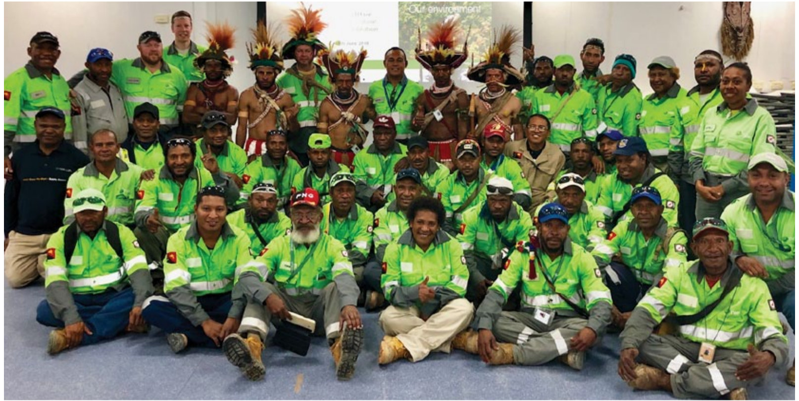
The Total Waste Management team celebrated achieving five-years LTI-free at HGCP.