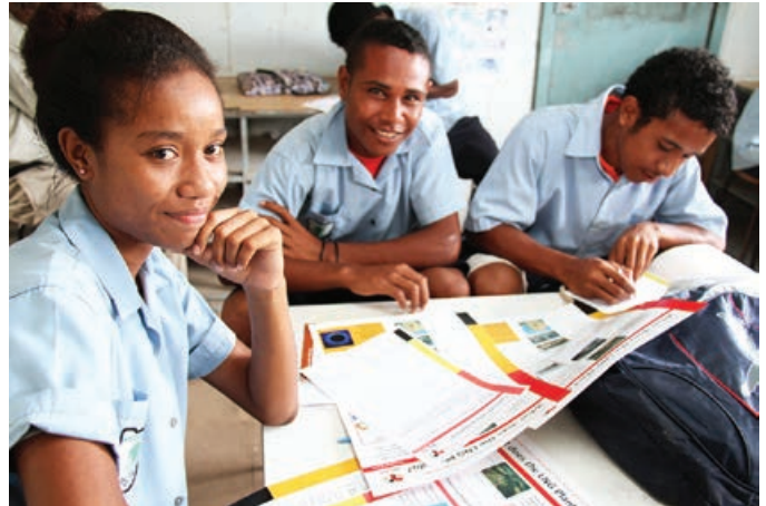
Science Ambassador Program materials being used to teach science at Redscar High School

The Program involves the use of science kits to provide students with a fun way to learn about science in the petrochemical industry.