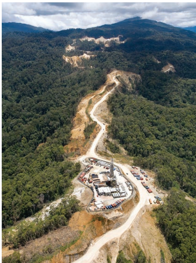
Drilling of the first of eight production wells is complete at Wellpad B