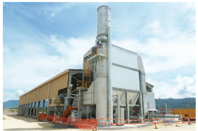
The Hides Waste Management Facility is the focal point of waste management activities

In areas where the Project footprint has disturbed native vegetation, we are implementing a program of reinstatement works. With completion of construction at Komo Airfield, the contractor's focus was on reinstatement activities, with more than 29 hectares of land reinstated by the end of the quarter. In addition, 192 kilometres of the onshore pipeline ROW has been reinstated.