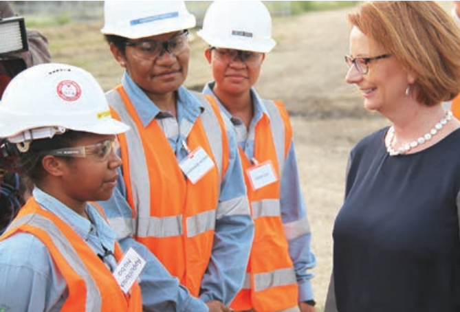
Julia Gillard, then Prime Minister of Australia, talking with Operations and Maintenance trainees

The then Prime Minister of Australia, the Prime Minister of Fiji, the Governor-General of Australia, Papua New Guinean national and provincial government representatives, and numerous Heads of Foreign Missions were among more than 170 dignitaries who attended 14 advocacy workshops and LNG Plant site visits during this quarter.