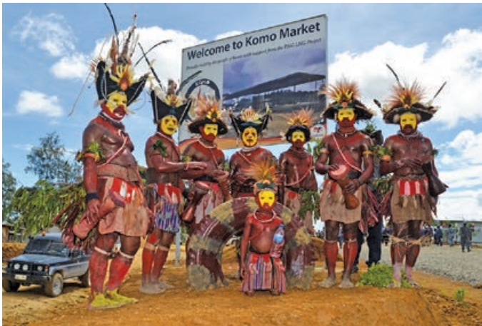
Traditional performers assist with the official opening of the Komo community market facility

During the second quarter, more than 180 women opened savings accounts in Hides and Komo to deposit funds from the sale of produce at the market.