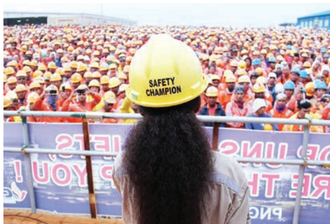
IIF® event held at the LNG Plant site

The LNG Plant site achieved a record 48 million hours worked between the first quarter 2012 and the second quarter 2013 without a Lost Time Incident. Much of this success is attributed to the site's Incident and Injury-Free® (IIF®) program, which achieved its own milestone with the graduation of the 13,000 th worker during this quarter. The IIF® program was introduced in the first quarter 2012 to provide workers and supervisors with insights and tools to better understand how their own attitudes and actions, as well as the attitudes and actions of others, impact safety in the workplace.