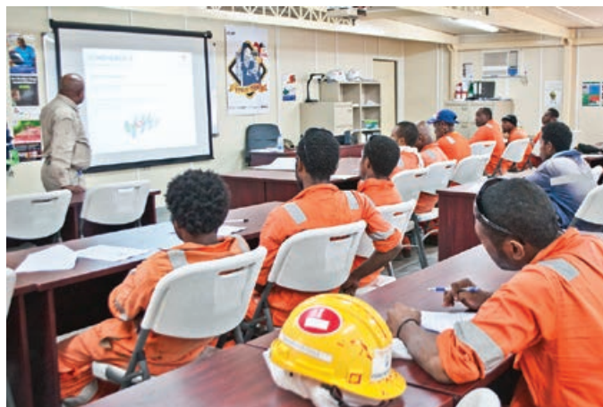
Transition training is providing workers with necessary knowledge to help obtain meaningful employment after leaving the Project

Drama performances are used to help highlight the processes that Landowner Companies (Lancos) will follow to demobilize their workforces and what workers can do to proactively prepare for demobilization.