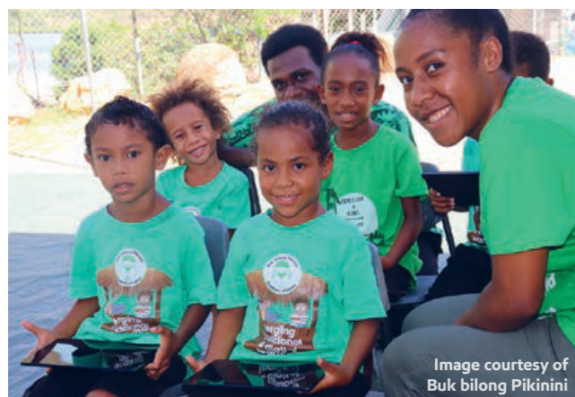
Buk bilong Pikinini launches a new early childhood development app

EMPNG is maintaining ongoing support for Buk bilong Pikinini in its mission to increase literacy rates through the establishment of community-based libraries that give children access to reading materials.