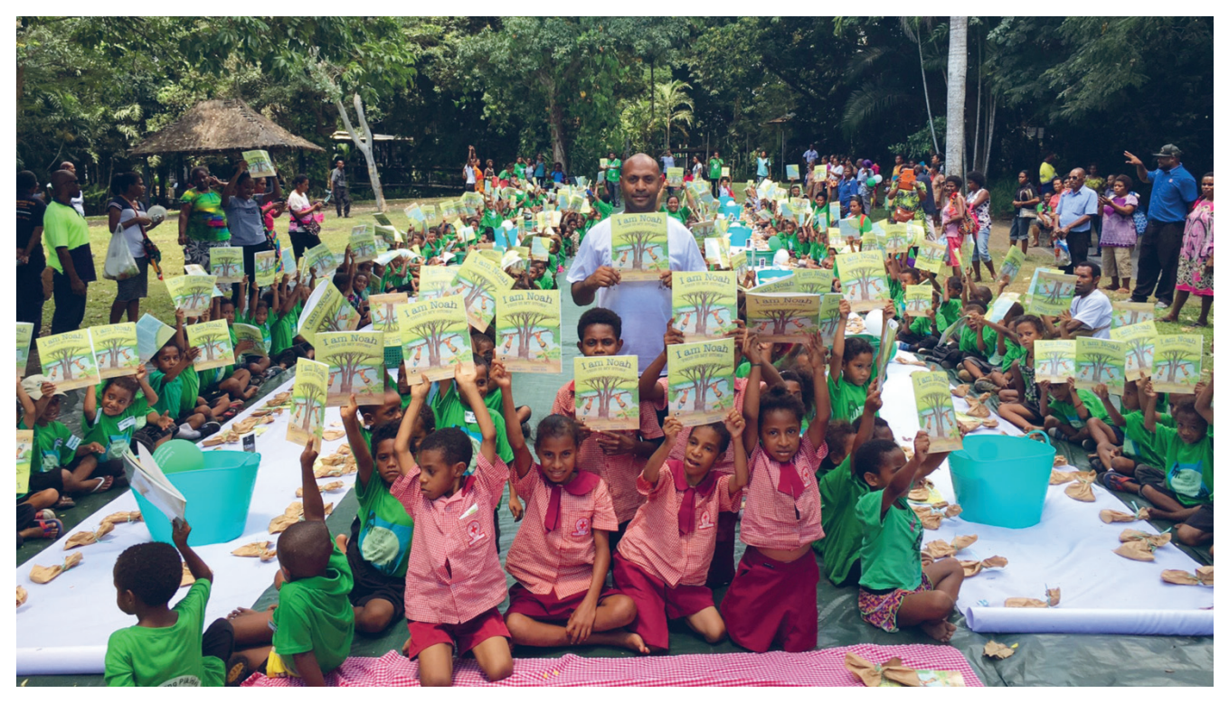
National Literacy Week activities at the Port Moresby Nature Park

Over the past decade, PNG LNG has worked with locally based stakeholders to improve educational facilities for Papua New Guinean students, from elementary school through to university. This has included the construction of multiple school facilities, the provision of university scholarships and the development of structured school programs, such as the Science Ambassador Program that encourages primary and high school students to consider careers in science, technology, engineering and mathematics through interactive educational activities. More than 5000 students have participated in the Science Ambassador Program during almost 90 classroom visits across Upstream area, LNG Plant site villages and Port Moresby schools since it was introduced to Papua New Guinea in 2013.