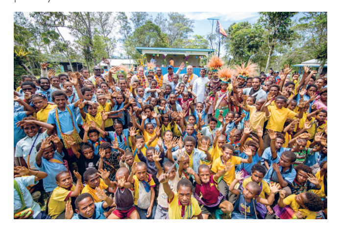
Students and teachers celebrate the handover of a new teacher's house at St. Paul's Primary School in Komo

EMPNG's support for schools, in partnership with provincial government authorities, in 2019 included: two new staff houses, a double classroom and sanitation facilities for Para Primary School; a new staff house and sanitation facilities for St. Paul's Primary School in Komo; and sanitation facilities for Redscar High School and Boera, Lea Lea and Papa primary schools.