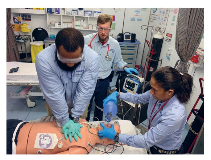
Clinical education session at the Hides Gas Conditioning Plant clinic

In 2018, the team received the Award for their contribution to raising mental health awareness in the workplace. The 2019 award recognised the team's review of the Malaria Control Program, which involved the adoption of a fit-for-risk approach.