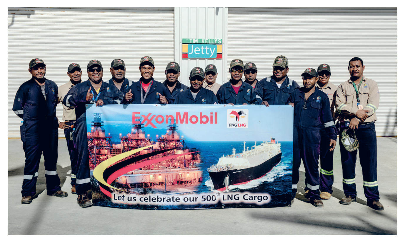
Workers celebrate the 500th LNG cargo at the LNG Plant Marine Terminal

To help workers proactively manage their health, EMPNG has introduced a Culture of Health program. The program consists of four elements: biometric health screening; health promotion and awareness; nutritional awareness; and physical activities. In 2019, EMPNG's Medicine and Occupational Health team was recognised with an ExxonMobil Global Health and Safety Award for the second consecutive year.